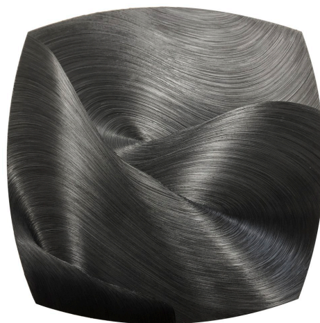
All the stars in the sky, Oil on canvas, 60"x 60", 152 x 152cm